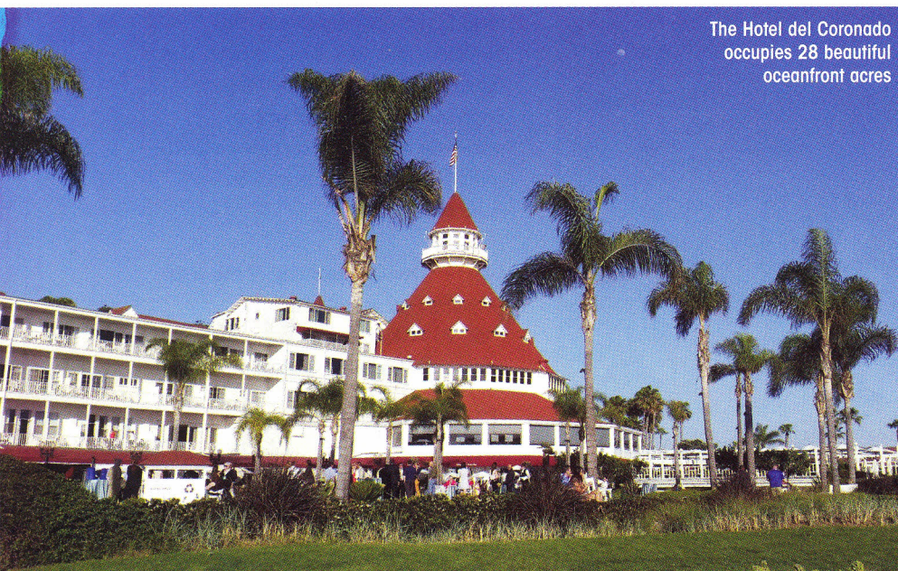
The Hotel del Coronado occupies 28 beautiful oceanfront acres