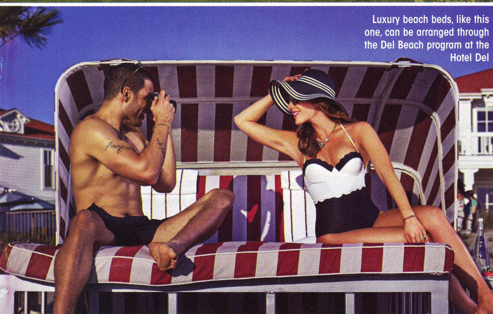
Luxury beach beds, like this one, can be arranged through the Del Beach program at the Hotel Del