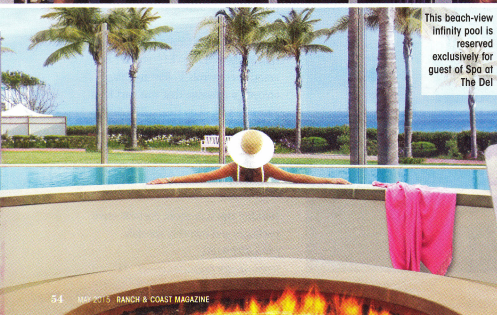
This beach-view infinity pool is reserved exclusively for guest of Spa at The Del