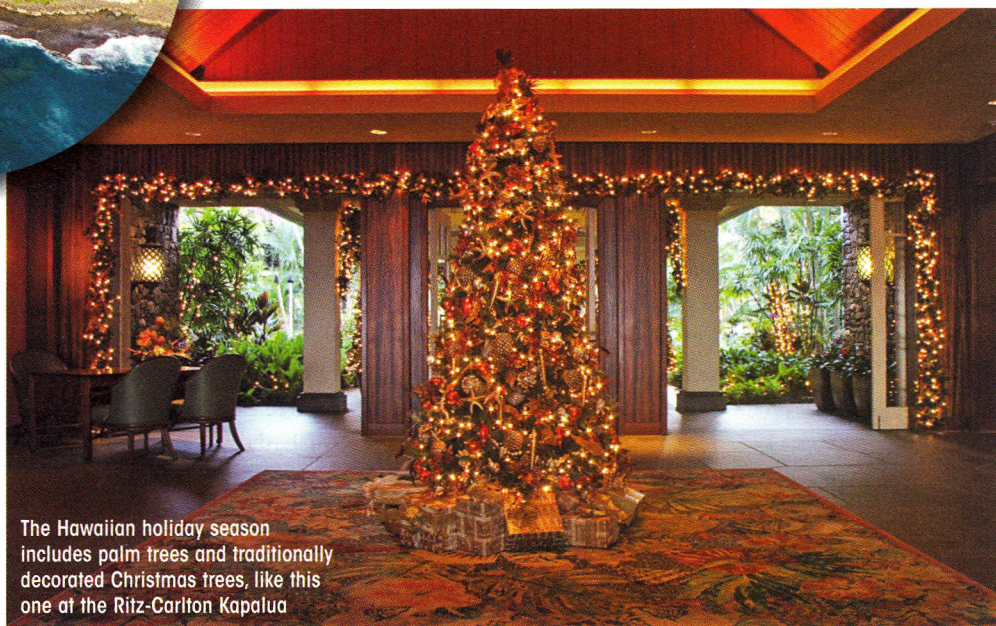
The Hawaiian holiday season includes palm trees and traditionally decorated Christmas trees, like this one at the Ritz-Carlton Kapalua