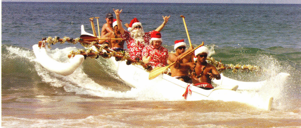
Santa, Mrs. Claus, and the elves arrive at the Fairmont Kea Lani in an outrigger canoe

whales, hike to an ancient lava flow, and practice underwater photography.