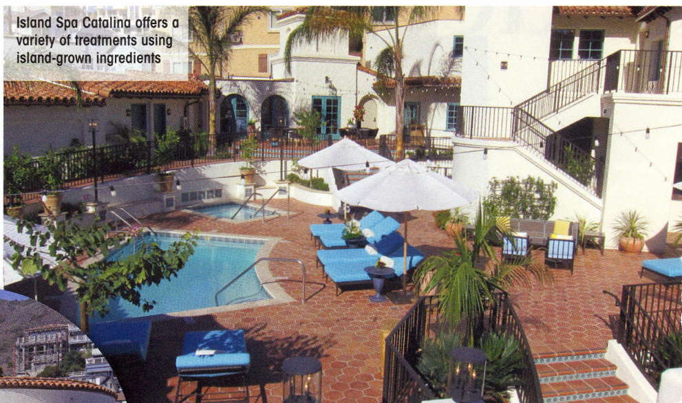
Island Spa Catalina offers a variety of treatments using island-grown ingredients

The result is a charming space in which to relax and de-stress. I am especially enamored with the al fresco deck on the second level where comfortable seating faces the harbor dotted with white yachts. This spacious co-ed relaxation area invites lingering with good friends or a good book. You could even pick up lunch or a beverage at the Spa Café and enjoy it here. I also really like the cozy sitting niches for one or two dotted around the complex, and I absolutely love the fact that there is a small tiled pool and a hot spa pool in the courtyard. (So