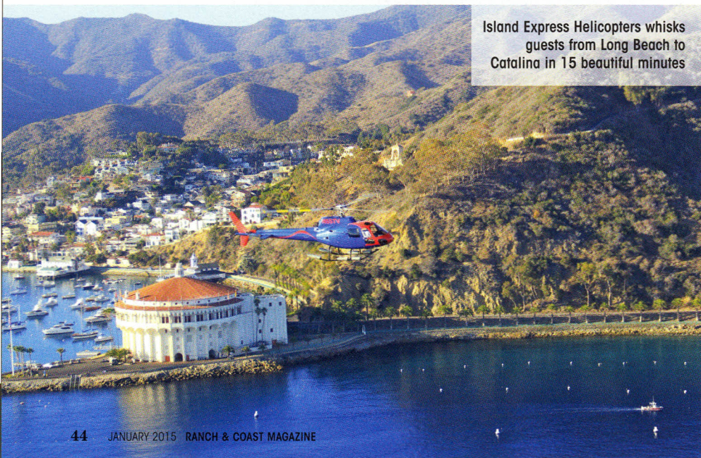
Island Express Helicopters whisks guests from Long Beach to Catalina in 15 beautiful minutes

We appreciated the waterfront location and the garden setting of the Pavilion Hotel. The generous breakfast buffet and complimentary wine/cheese hour were other bonuses. Standard rooms