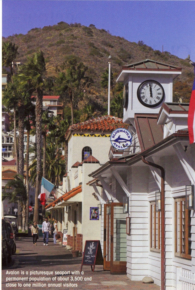
Avalon is a picturesque seaport with a permanent population of about 3,500 and close to one million annual visitors