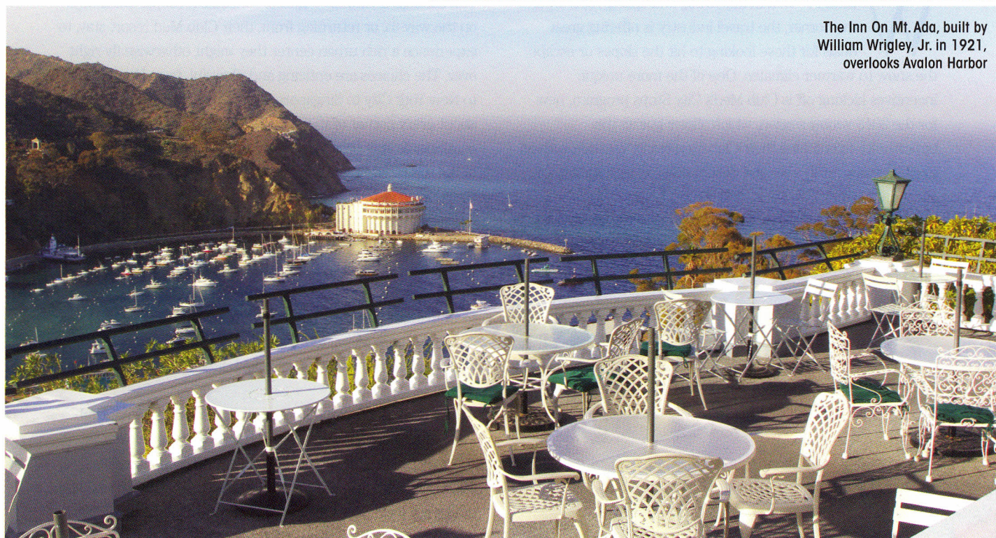
The Inn On Mt. Ada, built by William Wrigley, Jr. in 1921, overlooks Avalon Harbor